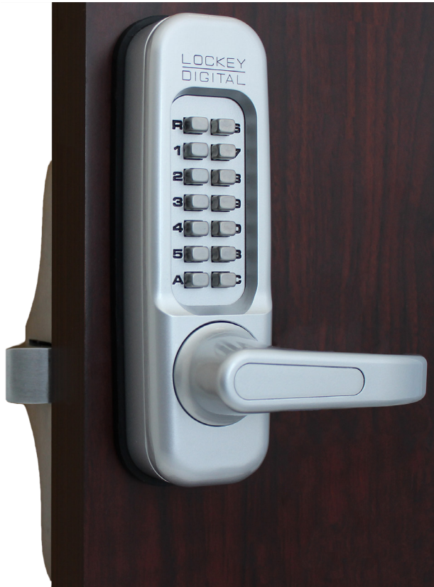
shown in Satin Chrome Marine Grade finish